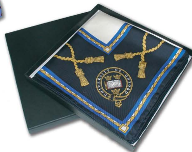
Stock plain box